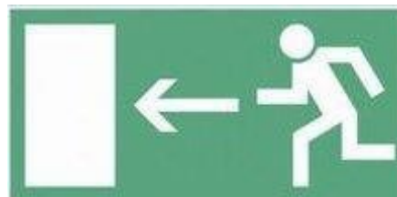
Exit route signage